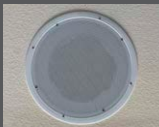
Garage Exhaust Vent Kit

The Garage Exhaust Vent Kit is designed to effortlessly convert the 20W and 30W fan into a practical garage exhaust vent, effectively cooling the space by eliminating both hot air and harmful fumes.