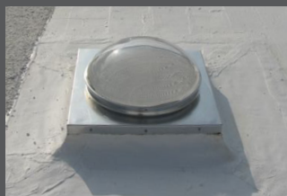
3 Roof Flashing Options: Curb Mount (pictured), Flat, & Pitched

Our commercial tubular skylights offer businesses the flexibility to introduce natural light into their spaces, regardless of their roofing system, including BUR (Built Up Roof), Foam, Metal, TPO, and even Green Roofs.